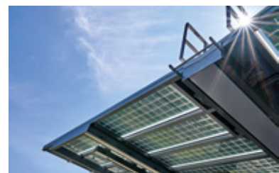
Glass-glass PV modules